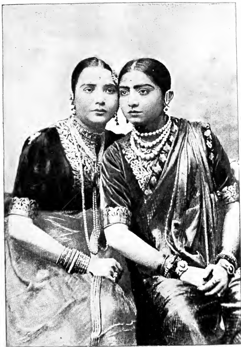
HINDOO NATCH GIRLS.